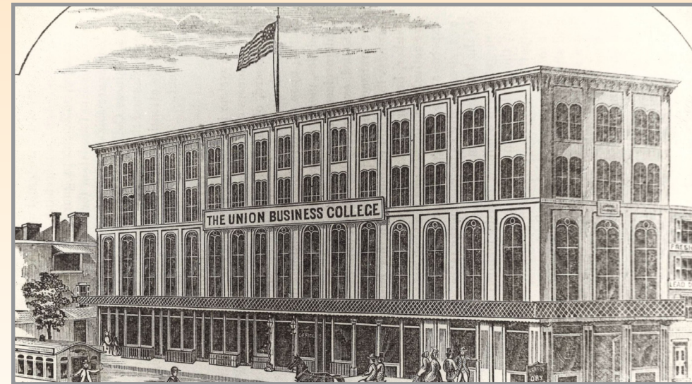
The Union Business College at 8th and Spring Garden Streets in Philadelphia