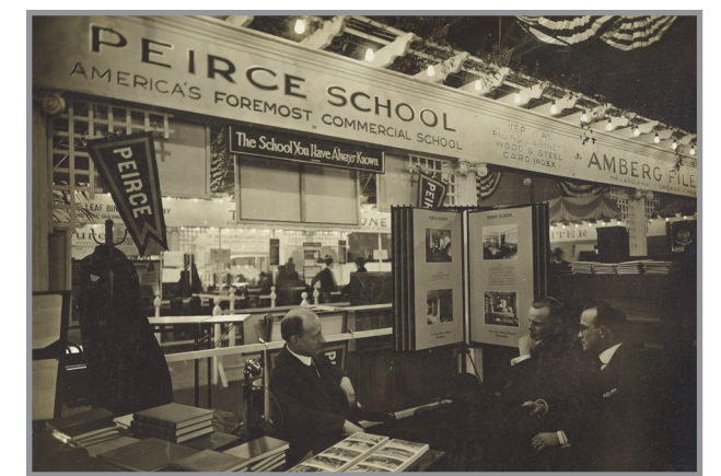
Peirce Exhibit at the Pan-American Exhibition, 1901