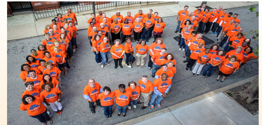
Peirce College - 150th Anniversary

For our 150th anniversary, we've built our celebrations around the theme of "Many Years, One Purpose". That purpose continues to be helping our students get the degree they need to achieve the life they deserve. Events are scheduled throughout the year - including this year's Spring Reception