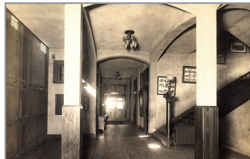
Pine Street entrance hall to Peirce, 1915